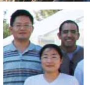
Asner Group - South America